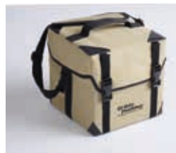
4 LITRES PAYLOAD