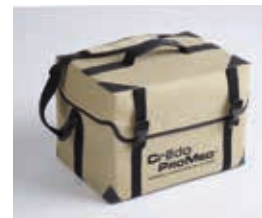
8 LITRES PAYLOAD