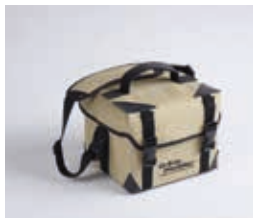
2 LITRES PAYLOAD